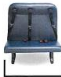
3-Point Belts (3PT)