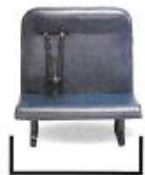
Child Restraint (CR)