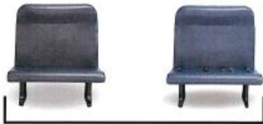
Lap Belt Ready (LBR)

Service Update #21-0208 / Blue Bird Service Bulletin #S19ZI