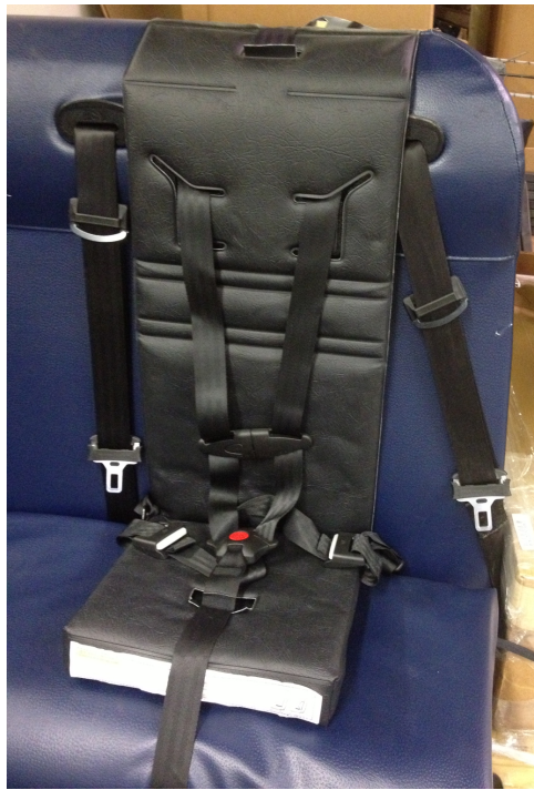
FIGURE #1 (HSM's Portable Child Restraint)

(b) Harnesses manufactured for use on school bus seats must meet S5.3.1(a) of this standard, unless a label that conforms in content to Figure 12 and to the requirements of S5.3.1(b)(1) through S5.3.1(b)(3) of this standard is permanently affixed to the part of the harness that attaches the system to a vehicle seat back. Harnesses that are not labeled as required by this paragraph must meet S5.3.1(a).