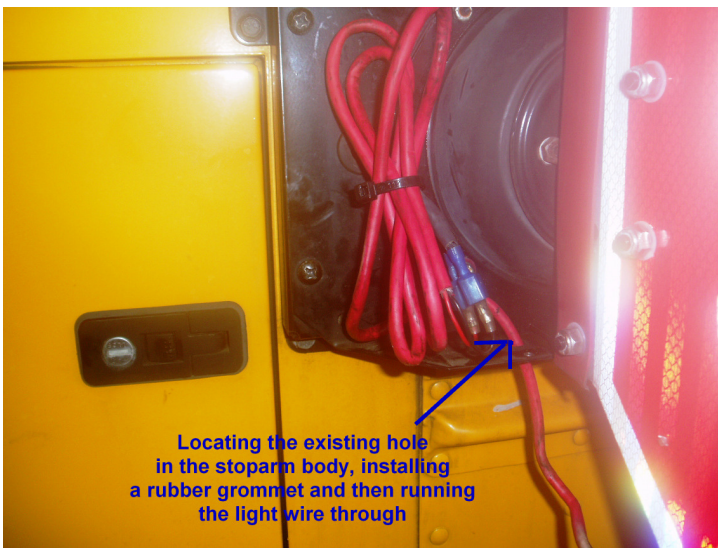
Locating the existing hole in the stop arm body, installing a rubber grommet and then running the light wire through