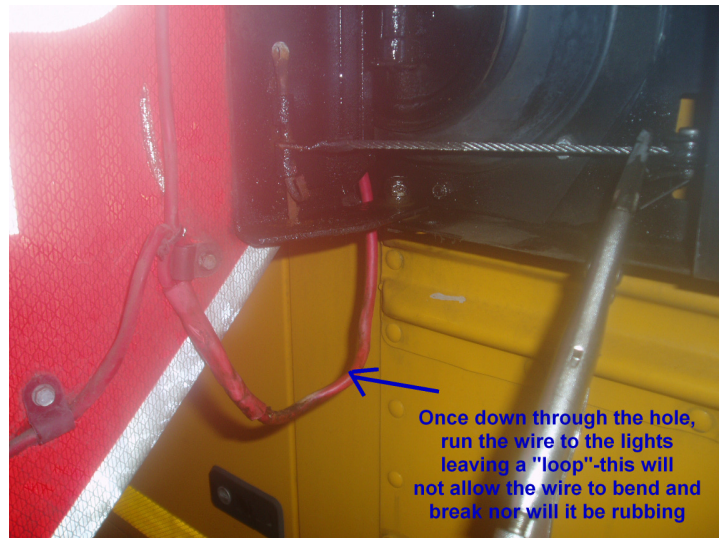
Once down through the hole, run the wire to the lights leaving a "loop"-this will not allow the wire to bend and break nor will it be rubbing